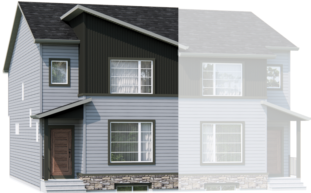
CONCORD II - MID CENTURY MODERN